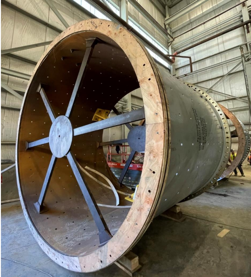
Figure 1 Ball mill shells delivered and brought into the mill building.

Crews have also achieved much progress on the civil works improving the various roads including grading, widening and berming along the 8km haul road from the Premier mill building to Big Missouri. The new water treatment plant location was finalized and crews have recently been clearing the area to prepare for construction.