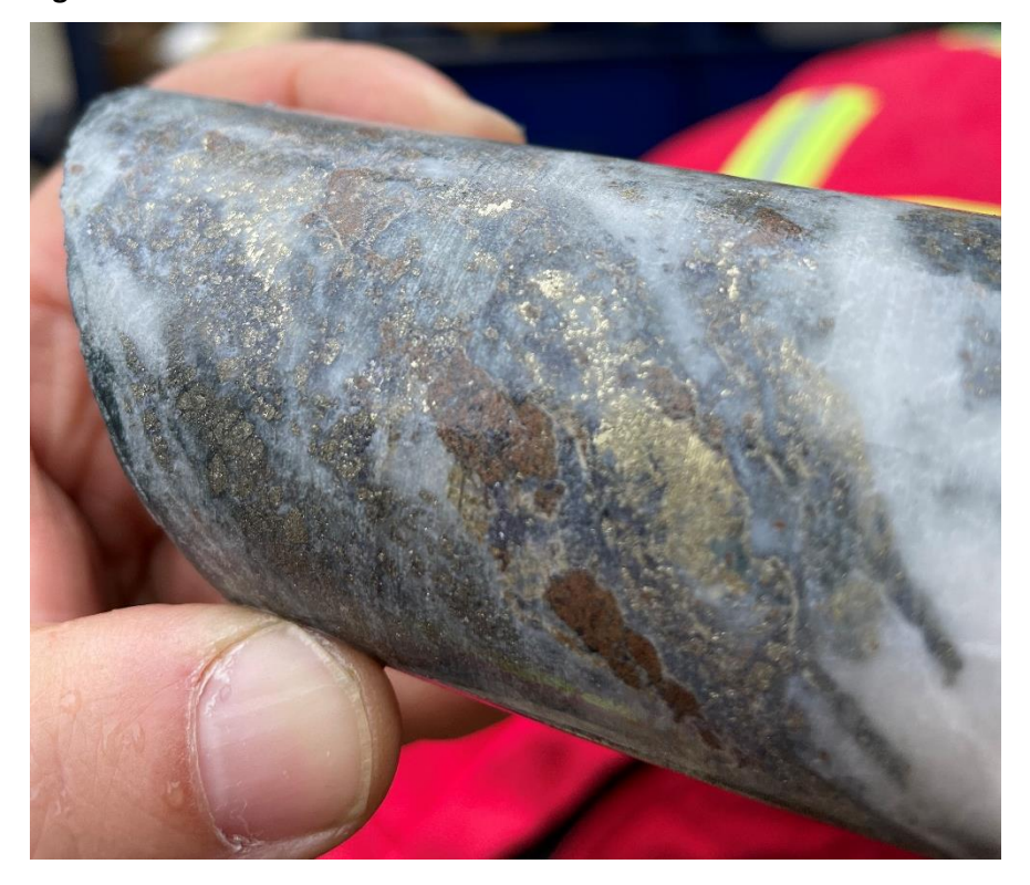
Figure 7 – VG in hole P22-2393 at the Sebakwe Zone

Ascot announced the start of its 18,000 metre exploration drill program last month (see News Release dated May 9, 2022), with drilling commencing on the Sebakwe Zone first. An initial 12 holes have been drilled this season from the same surface pad used for the first two holes in October 2021. Assays are still pending for these 12 new holes, but early visual indications are encouraging for the continued growth of the Sebakwe Zone. In particular, drill hole P22-2393 intersected a significant amount of coarse, visible gold ("VG") at a depth of 316 metres, which corresponds with the predicted depth of the Sebakwe structure in that location. The targeted quartz-breccia veins were intersected at predicted intervals, and while assays are pending, the structures are now known to be present over a strike extent of 70 metres and a vertical extent of 120 metres.