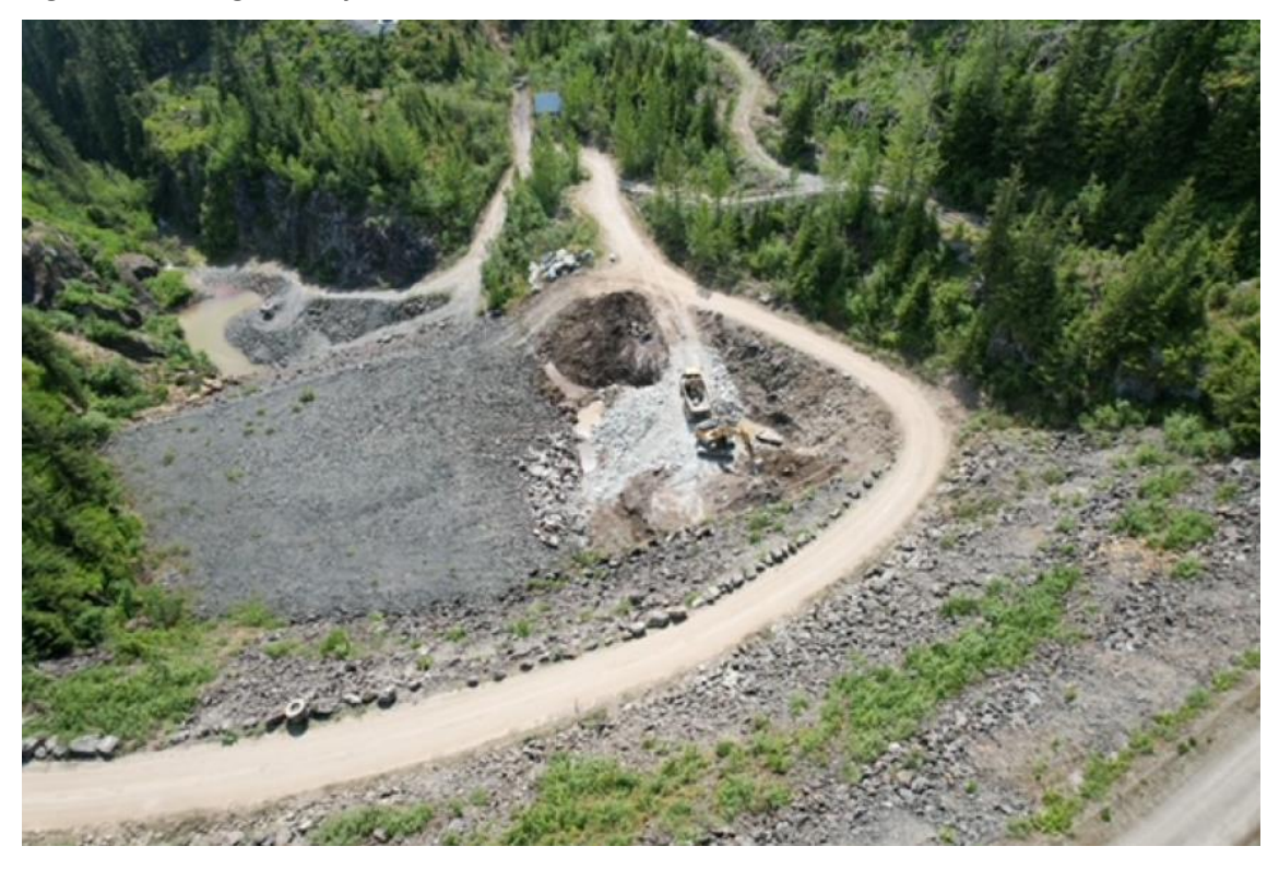
Figure 6 – Cascade Creek diversion channel excavation

Figure 5 – Tailings facility south dam earthworks