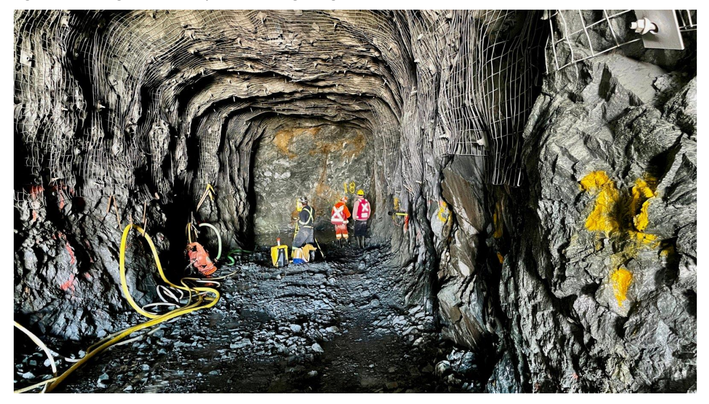
Figure 1 – Underground development heading at Big Missouri

• Mill interior and exterior construction: Following the installation of the Ball and SAG mills in 2021, the Ball and SAG mill motors have now been installed. The main transformer has been installed and the high voltage power line has been established to the mill building. Most mill building electrical systems and the MCCs have been installed. The Falcon gravity concentrator has been delivered. The mine dry, washrooms, offices, and workshop areas have been installed and are being used. Outside the mill building, earth works, foundation, and erection work has been done on the tailings thickener and cyanide destruction tanks. Most of the activities in and around the mill building will be placed on hold until alternative financing is arranged, with a plan to restart in the Spring of 2023.