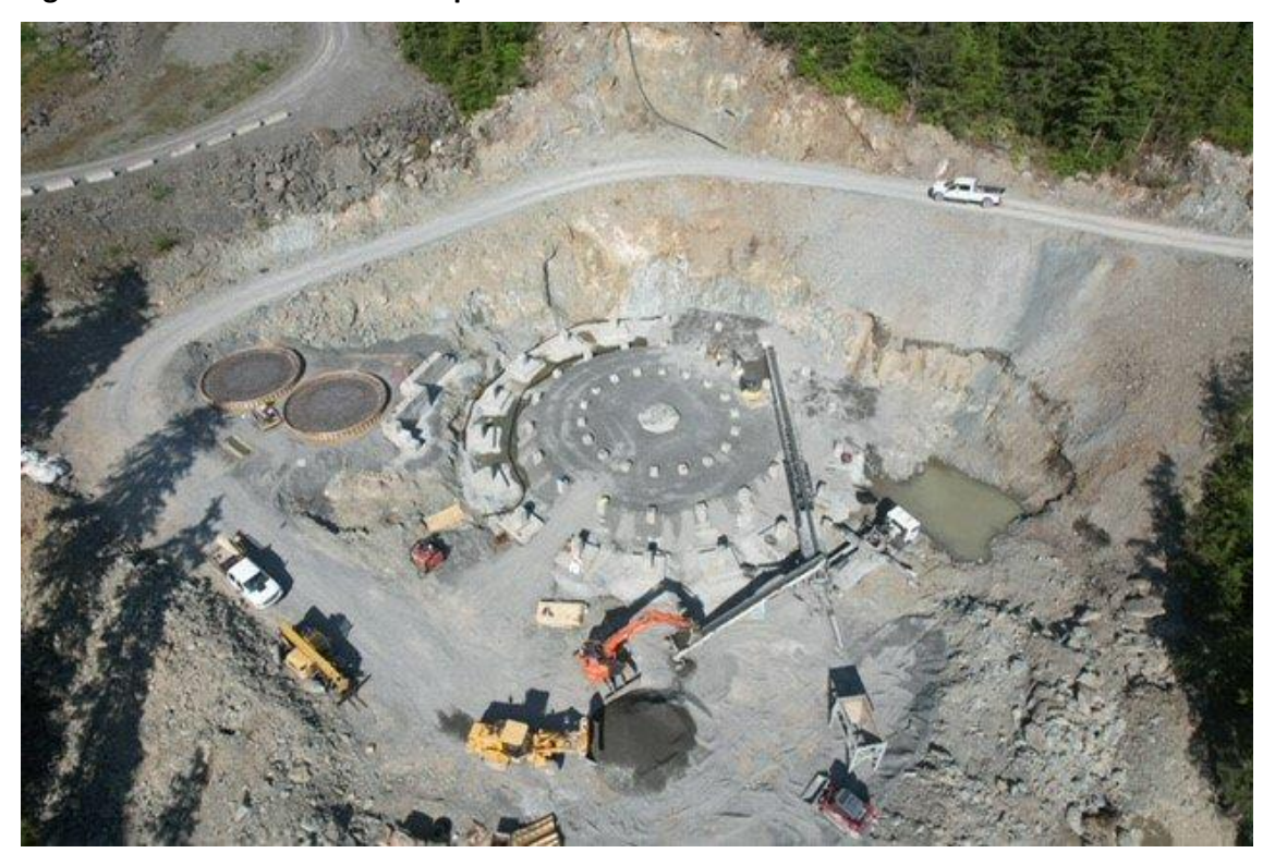
Figure 4 – New water treatment plant clarifier and lime tank foundations

• Tailings facility earthworks : Earth works have continued on excavating the CCDC the material from which is being transported to the south dam of the tailings facility in order to achieve a 2:1 slope. These earth works activities will be placed on hold until alternative financing is arranged, with a plan to restart in the Spring of 2023.